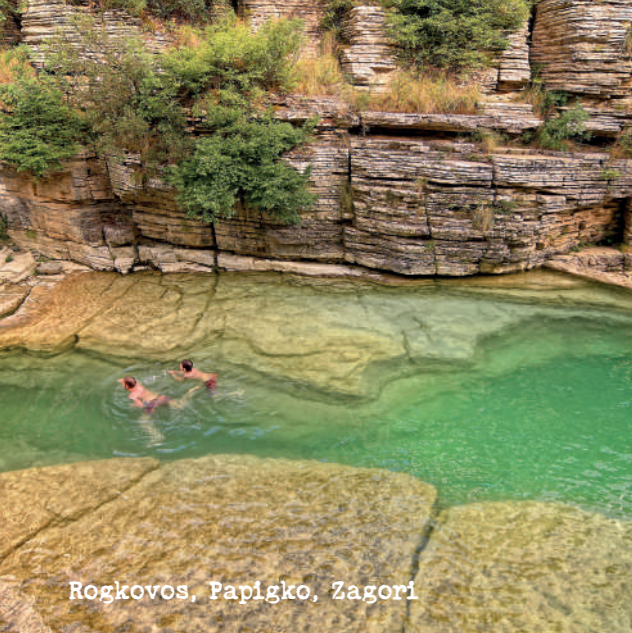
Rogkovos, Papigko, Zagori

From the atmospheric Zagorochoiria to the unknown Mastorochoiria, the alternative Konitsa and the hidden villages of Pogoni, Katsanochoiria and Tzoumerka.