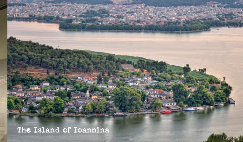
The Island of Ioannina