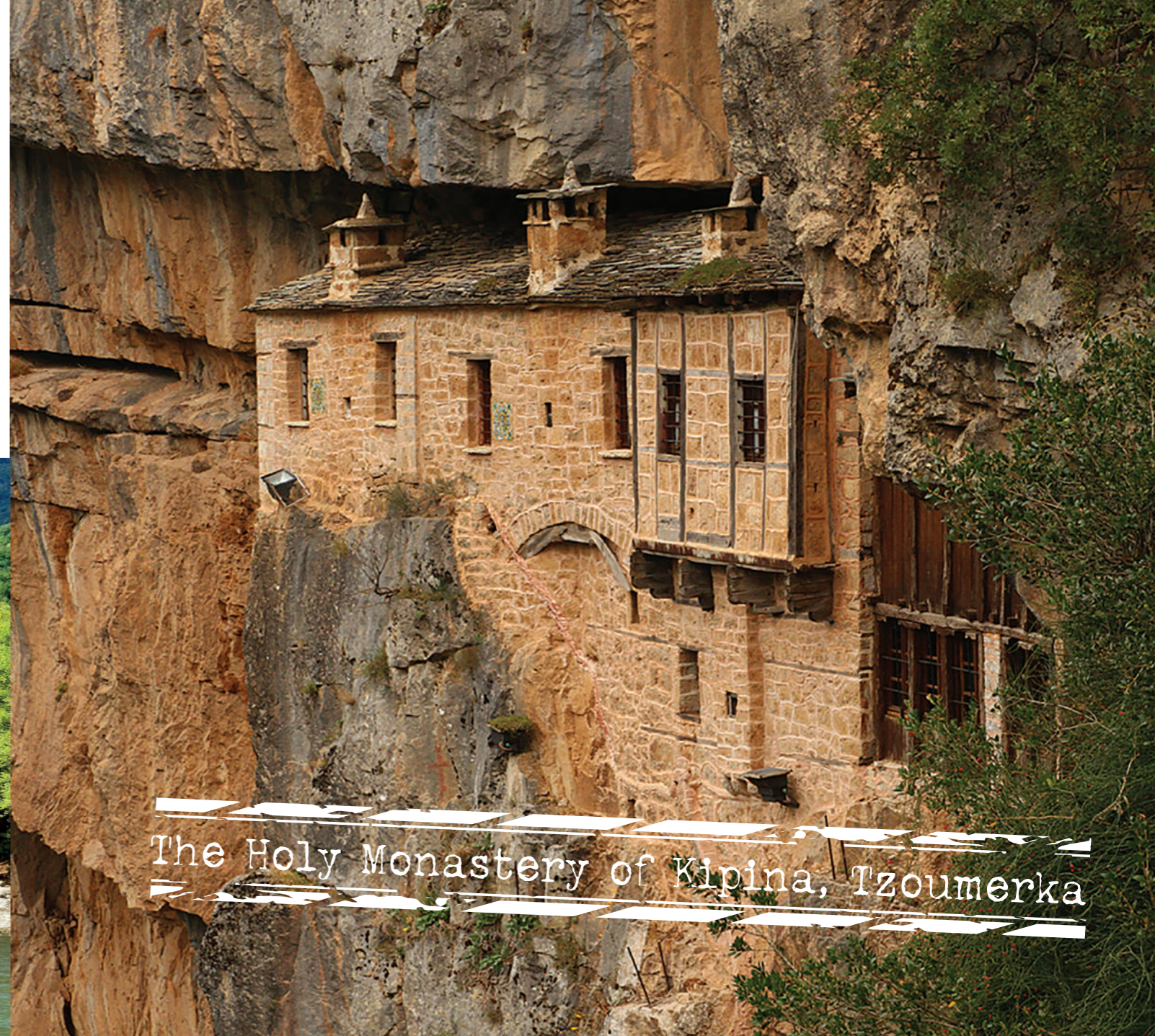
The Holy Monastery of Kipina, Tzoumerka