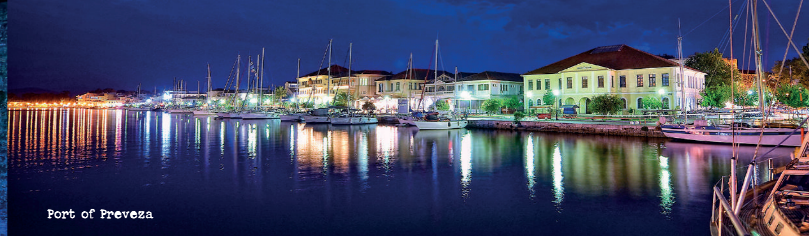
Port of Preveza

From Preveza and the Archaeological Site of Nikopolis with its new museum to the springs of Acheron River the gates of the underworld and the necro oracle.