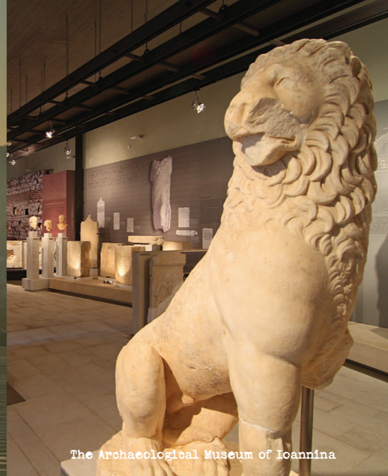
The Archaeological Museum of Ioannina