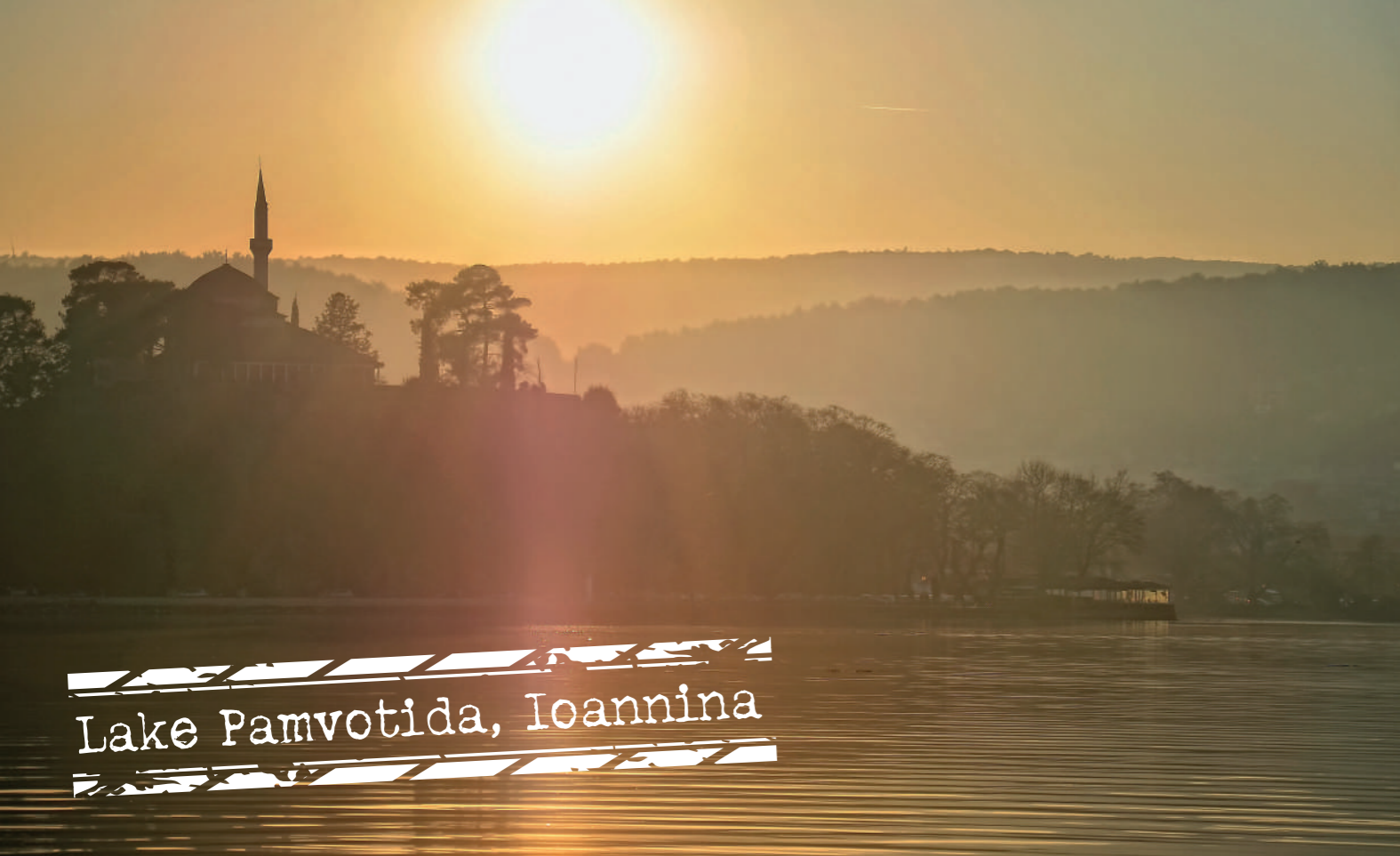
Lake Pamvotida, Ioannina