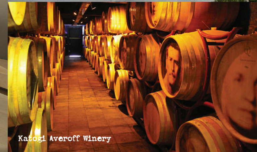
Katogi Averoff Winery

From the imposing mountains, the traditional villages, the rivers and the lakes, the picturesque stone bridges and national parks to the lacy beaches of the Ionian Sea with the crystal clear waters and the picturesque alleys.