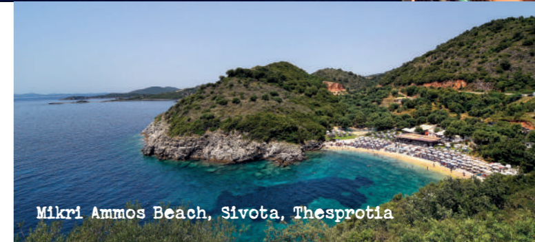
Mikri Ammos Beach, Sivota, Thesprotia

From the cosmopolitan resorts of Parga, Sivota and Perdika to the simple fishing village of Sagiada at the northern end of the coastline.