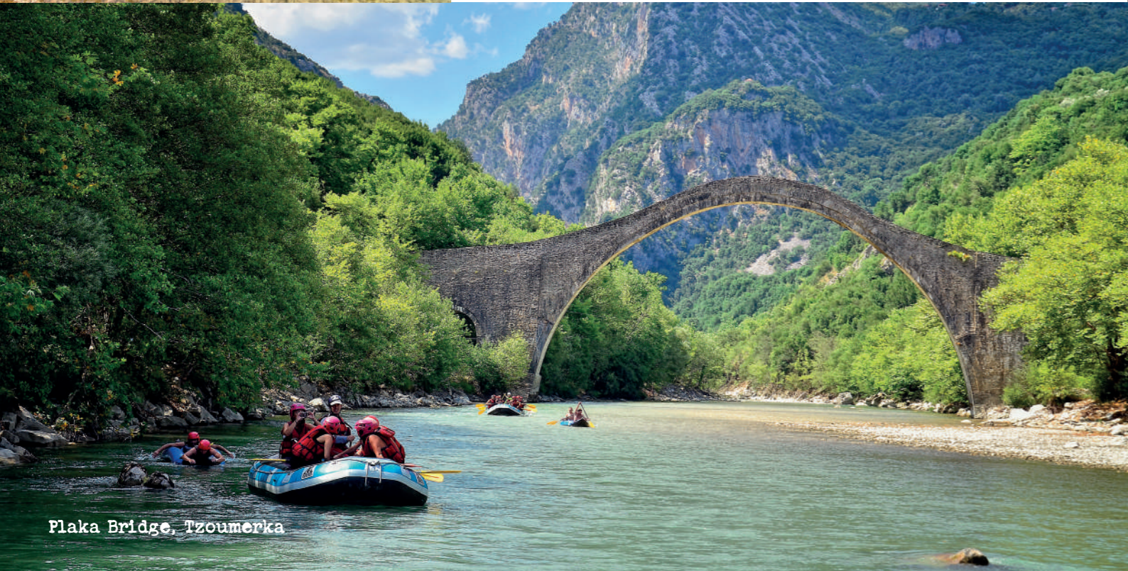
Plaka Bridge, Tzoumerka

From the atmospheric Zagorochoiria to the unknown Mastorochoiria, the alternative Konitsa and the hidden villages of Pogoni, Katsanochoiria and Tzoumerka.